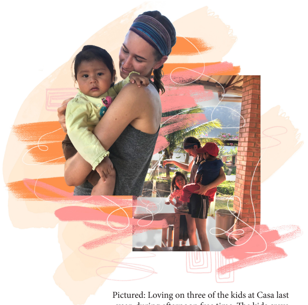
Pictured: Loving on three of the kids at Casa last year, during afternoon free time. The kids crave intentional time and CONSTANT HUGS.

To make this trip a reality, I need your support. First, please pray for us! Global travel has plenty of moving parts, concerns, and details surrounding it. Pray for safety for our team. Above all, pray that God would move in and through us as we go to build up our brothers and sisters, as they bring Life to the people of Caranavi!