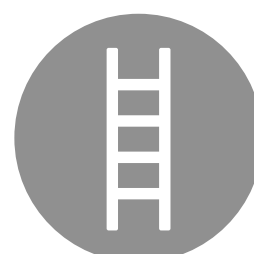
CAREER & WORK ETHIC