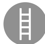
CAREER & WORK ETHIC